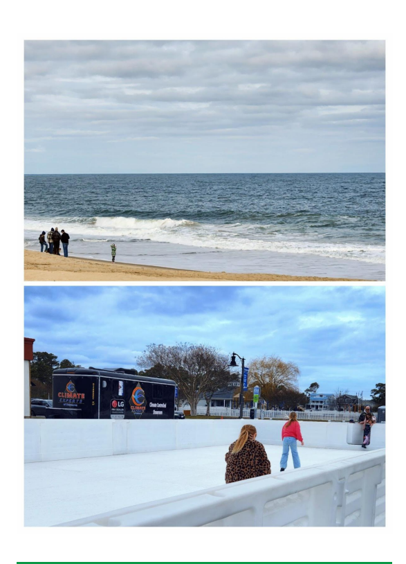
People Enjoying the Cold Ocean & the Skating Rink