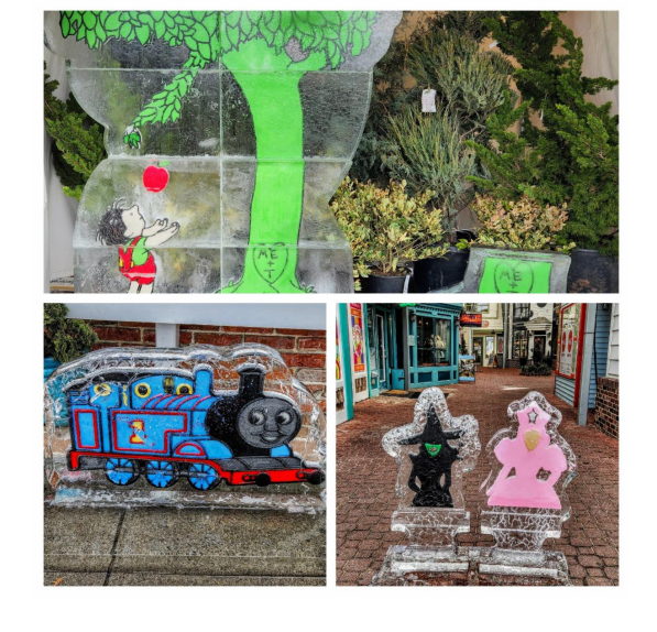
Snapshots of Some of the Book-themed Sculptures