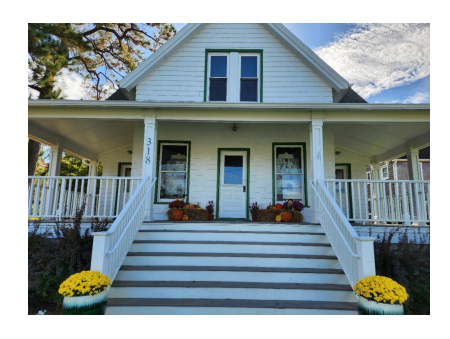
Happy One-Year Anniversary to our Town Museum

Come visit the historic Dinker-Irvin House during Summer Hours