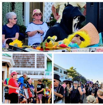
Goodbye to a Great Summer 2023