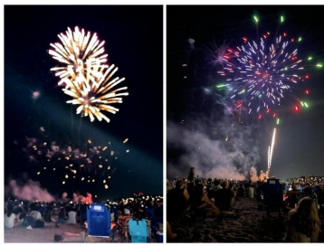
Labor Day Fireworks