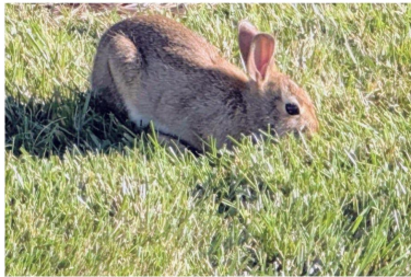
Bunnies Enjoying the Town Hall Lawn