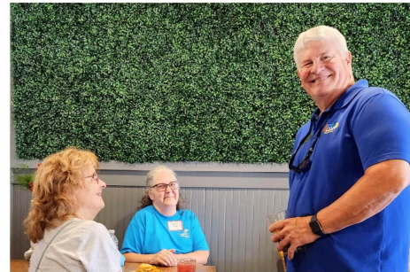
Building Community: Neighbors Meeting Neighbors