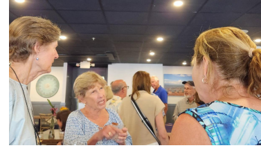
Great Conversation & Fun at Zoca with BBLA Board and Our Wonderful Members