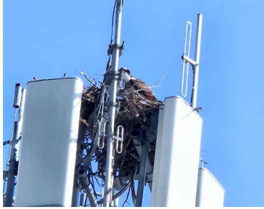
Osprey Nest - Top of Cell Tower Behind Town Hall Park